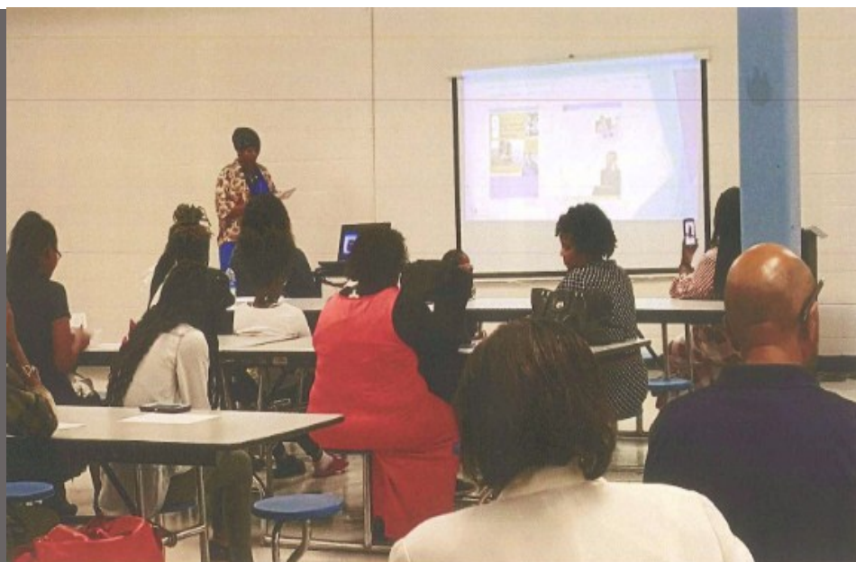
Parents receiving valuable information at a school's parent night

Additionally, the Title I department will provide training to principals during the 2018-2019 district summer leadership team summit and will post a webinar so principals will understand parent and family engagement requirements and plan opportunities for family engagement activities and meetings for the remainder of the school year.